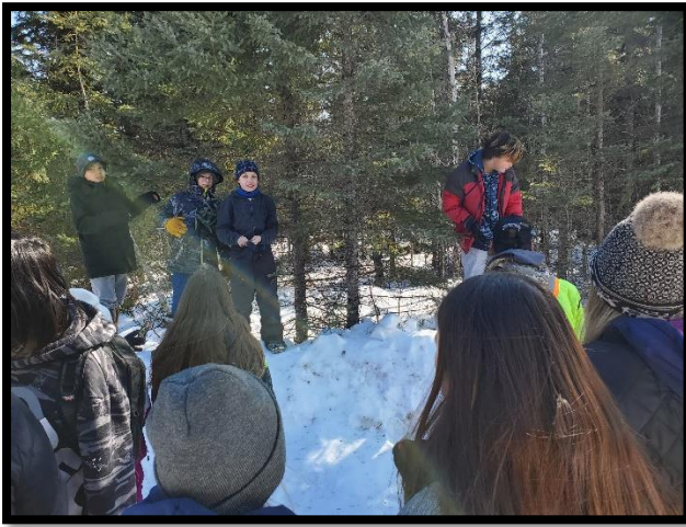
Grade 7 and 8 learn about our local natural resources at Peguis Camp