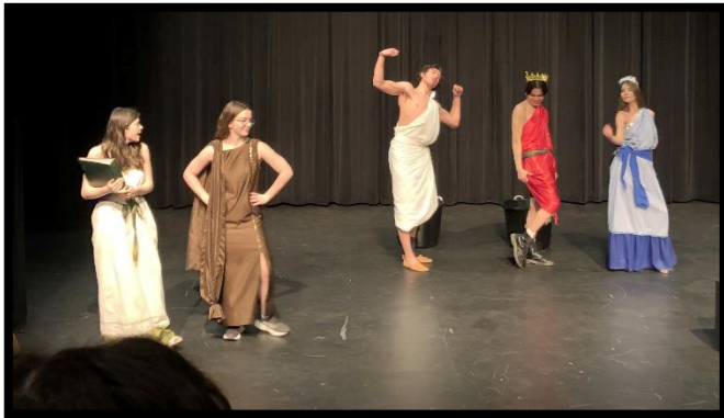
Above: Our Senior Drama students put on a spectacular play this year, “ The Greek Mythology Olympiaganza ”. They had the opportunity to showcase their talents and learn from others by performing at the Manitoba Youth Drama Festival in Winnipeg.