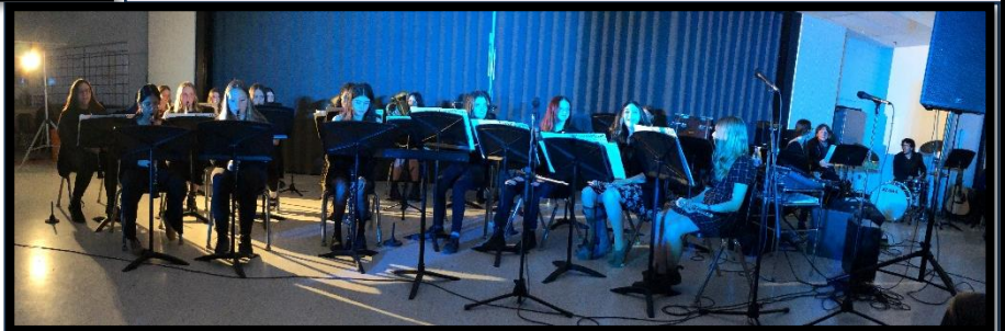
Above: Our grades 7 to 12 school band held their Spring Concert , as well as travelling to Fisher Branch to perform. Their music themes for this year connected to Science, Nature, and South America.