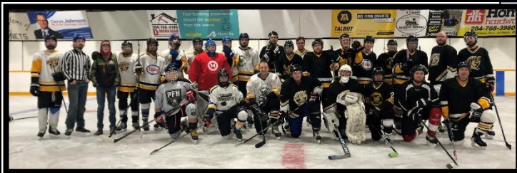
Above: Our annual Safe Grad hockey game is always a popular event for students and community in Ashern. Thank you to everyone who supports our graduates!