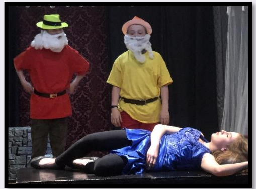
Right: Our Junior Dramatics Club collaborated on a play to be remembered with their production of “ The Brothers’ Grimm Spectaculathon ”. A collection of familiar tales with unfamiliar twists! We can’t wait to see the work of these young actors as they move into our senior program in years to come!