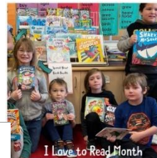
I Love to Read Month