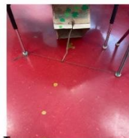
Leprechaun Trap Building